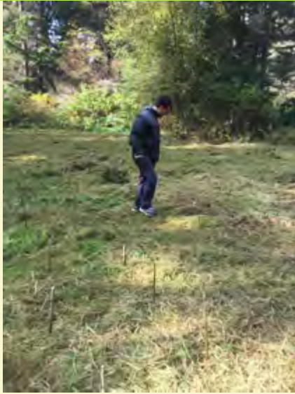
Maltby Live Willow Stakes