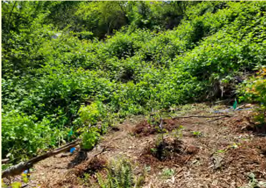
Southern planting area

Forty-five minutes into the work party, a welcome surprise arrived in the form of six members of the fraternity. I was excited to see them. I had the young men sign up and join the rest of our group in carrying the wood chips and building the rings.