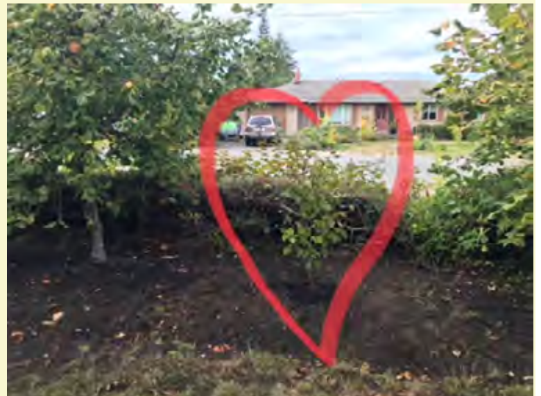
Qualicum Beach, BC