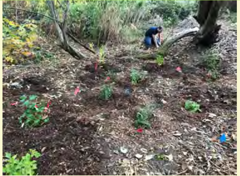
Seattle Greenbelt Restoration