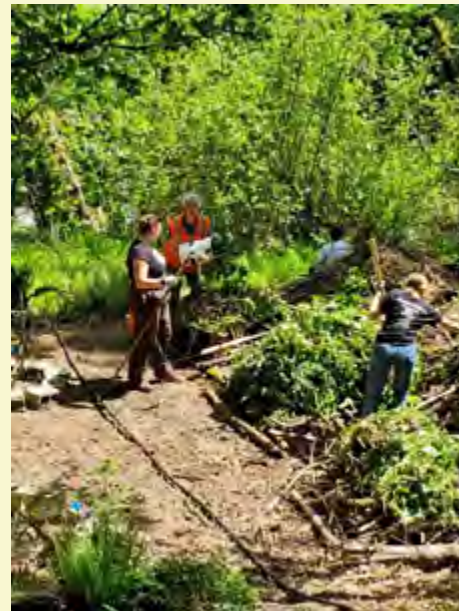
The weeds were taken to The Rack Zone and put on racks to dry out.

Neither Shirley nor I had taken any photos of the group that had cleared weeds in the planting area near the wood chip pile earlier in the work party but I did get one of what the area looked like after it was cleared. Imagine the area in the photo below with 100+ invasive vines emerging from the ground and you will get a sense of what it looked like at the beginning of the work party.