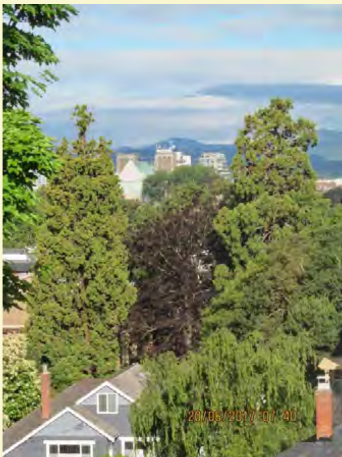
The former view from the back of the property.

The same thing is happening in cities all over the world.