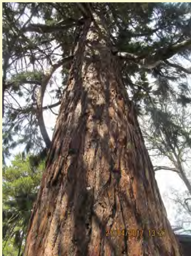
One of the giant sequoias – still a kid at 150 years old.

Last summer, three of us met through a local environmental organization. We were all concerned about the urban forest, and decided to start the Community Trees Matter Network. Just five months later, we have more than 100 members, and 300 followers on Facebook. Clearly, urban tree loss is important to a lot of people!